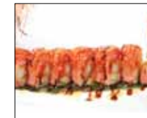
Angry Dragon $16