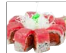
Red Dragon $14