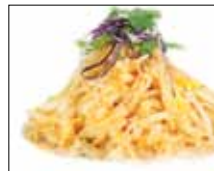
Vermicelli Salad $10