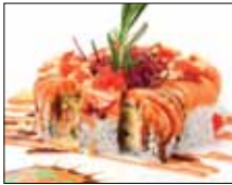
Sunshine Roll $14