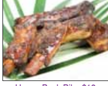
Honey Back Ribs $12