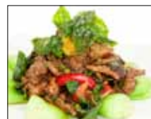
Thai Basil Steak $24