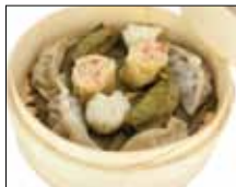
Dim Sum Sampler $12