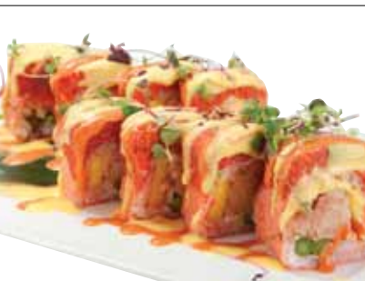
Painted Lady Roll $16