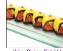
Valley Stream Roll $14