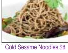
Cold Sesame Noodles $8