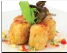
Thai Crab Cake $12