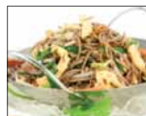
Chicken Soba $15