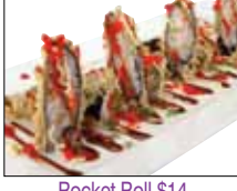
Rocket Roll $14