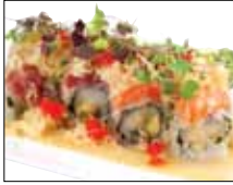
Tobiko Roll $14