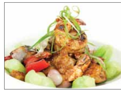
Wok Grilled Garlic Shrimp $22