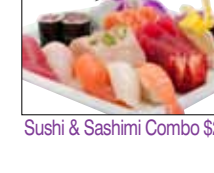
Sushi & Sashimi Combo $26