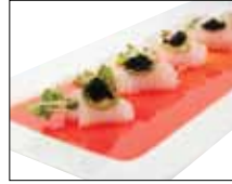
Yellowtail Ceviche $13