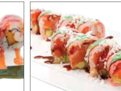
Mitsui Roll $15