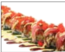
Tuna Amazing $14