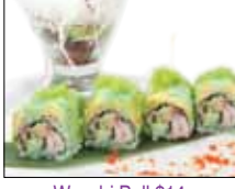
Wasabi Roll $14