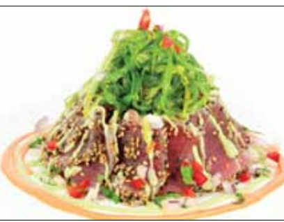
Pan-Seared Tuna w. Soba Noodle $22