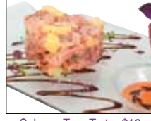
Salmon Toro Tartar $13