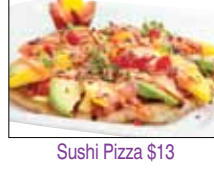
Sushi Pizza $13