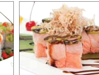
Jalapeno Yummy $16