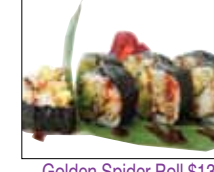
Golden Spider Roll $13