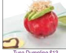
Tuna Dumpling $13