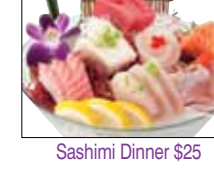
Sashimi Dinner $25