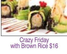
Crazy Friday with Brown Rice $16