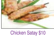
Chicken Satay $10