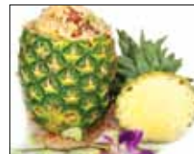
Chicken w. Pineapple Fried Rice $15