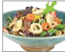
Calamari Salad $8