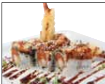
Ninja Roll $14