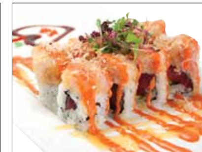
The Yankee Roll $16