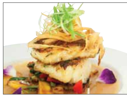
Pan Roasted Chilean Seabass $26