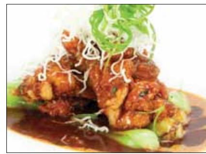
Crispy Red Snapper $21