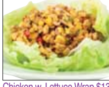
Chicken w. Lettuce Wrap $13