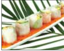
Summer Roll $11