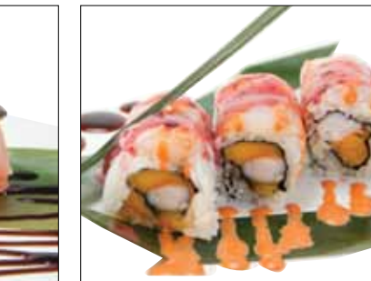
New York Roll $16