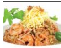
Shrimp Pad Thai $15