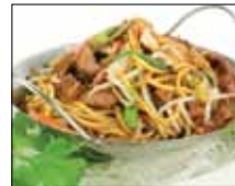
Beef Lo Mein $15