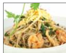
House Special Mei Fun $15