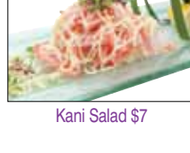
Kani Salad $7