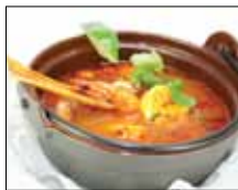
Tom Yam Soup $7