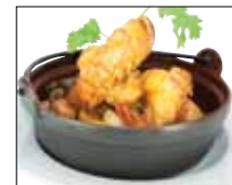
Seafood Rainbow Casserole $23