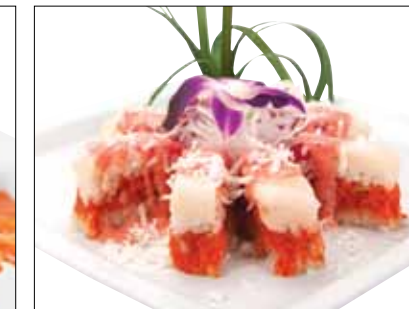
Osaka Box $16