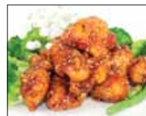
Sesame Chicken $17