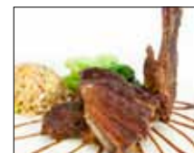
Crispy Duck $19