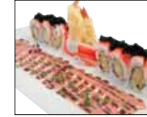
Black Angel $14