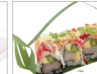
Out of Control $15