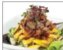
Duck Salad $12

If you have a food allergy, please speak to the owner, manager, chef or your server