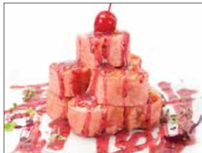
Hadeed Roll $16