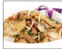
Beef Chow Fun $15