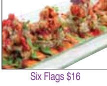
Six Flags $16